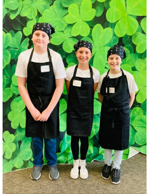
Chopping Cheetahs 4 th Place Side Dish