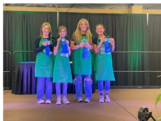
Burger Besties 1 st Place Healthy Dessert