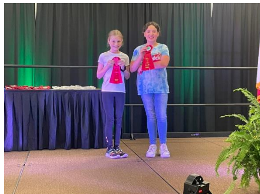
Chefs 227! 2 nd Place Healthy Dessert