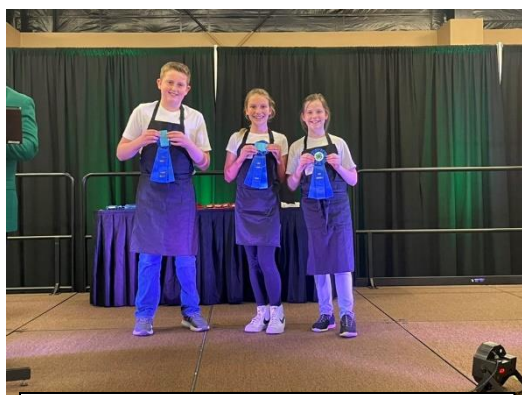
Slicin' Dicin' Chefs – 1 st Place Side Dish