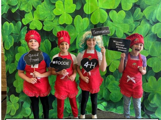
Cheering Cherries 4 th Place Main Dish