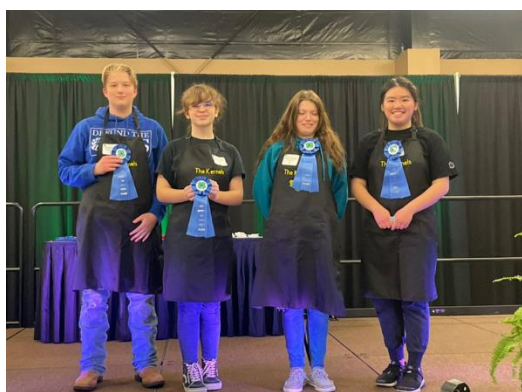
Kernal Corn 1 st Place Appetizer Senior Team Advances to State

Educational programs of the Texas A&M AgriLife Extension Service are open to all people without regard to race, color, religion, sex, national origin, age, disability, genetic information, or veteran status. The Texas A&M University System, U.S. Department of Agriculture, and the County Commissioners Courts of Texas Cooperating. Americans with Disabilities - Individuals with disabilities who require an auxiliary aid, service, or accommodations to participate in any Extension activities are encouraged to contact Gregg County Extension Office at (903)-236-8428 to determine how reasonable accommodations can be.