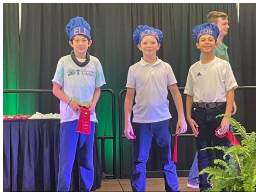
The Brunch Boys – 2 nd Place Appetizer