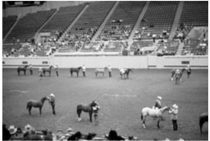
Some young horses must achieve rapid early growth to be competitive.

Sound feeding management, including feeding a balanced nutrient supply, is crucial to improving profit through more marketable and useful horses. With such an approach, problems may still emerge from time to time, but sound early management can be expected to make a difference in young horses' development, regardless of the animals' intended purpose.