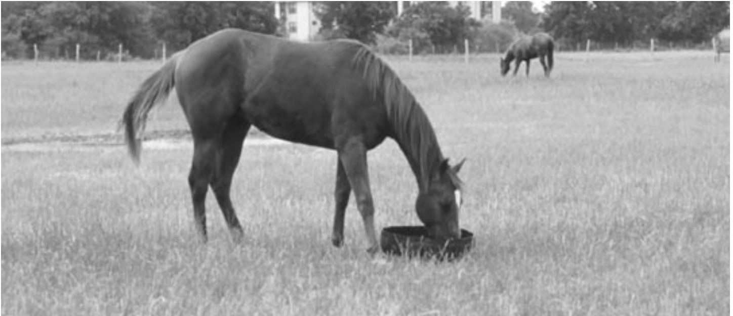
Yearlings will grow at a moderate rate on improved pastures. Supplemental feeding will further improve body condition and gain.

forced exercise should include routine evaluation; in most cases, young horses also will benefit from free exercise. Intense, hard work should be introduced gradually to encourage proper bone remodeling. Sudden changes in stress cause the skeletal system to remodel bone, but it takes time to develop needed strength. If at all possible, conditioning programs should provide adequate free exercise. Some conditioning programs alternate intense work with free exercise and less-intense work on a weekly basis to provide time for bone remodeling to occur. Well over half of Texas farms surveyed reported using forced exercise on an every-other-day basis 12 . Such schedules are supported by research showing the importance of providing adequate recovery time from skeletal strain. 30