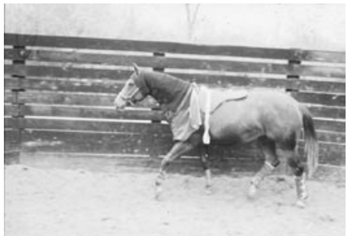
Forced exercise should be conducted on footing that is not too deep.

Routine after-weaning management usually creates an artificial environment of meal feedings. Foals are accustomed to nursing 70 times per day early in life, then typically end up in confinement or semi-confinement, in a meal-feeding situation. While young horses most commonly are fed twice daily, evidence suggests that feeding three or four times in 24 hours actually may improve nutrient absorption while decreasing surges in glucose and insulin. 11 For maximum success and minimal digestive problems, feedings should be evenly spaced, with equal time intervals between each feeding, including from the last feeding of the day to the first feeding of the next day.