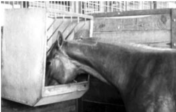
When fed for rapid development, numerous evenly spaced feedings over 24 hours help promote growth.

Forced exercise associated with fitting programs increases yearlings' needs for calcium, phosphorus and magnesium. Recent research with long yearlings in training has demonstrated a 35% increase in requirements for calcium and phosphorus. It appears magnesium requirements are about two times higher than previously estimated. 30,46 These mineral needs are best met by feeding formulated horse feed rather than by trying to supply individual minerals in addition to the feed.