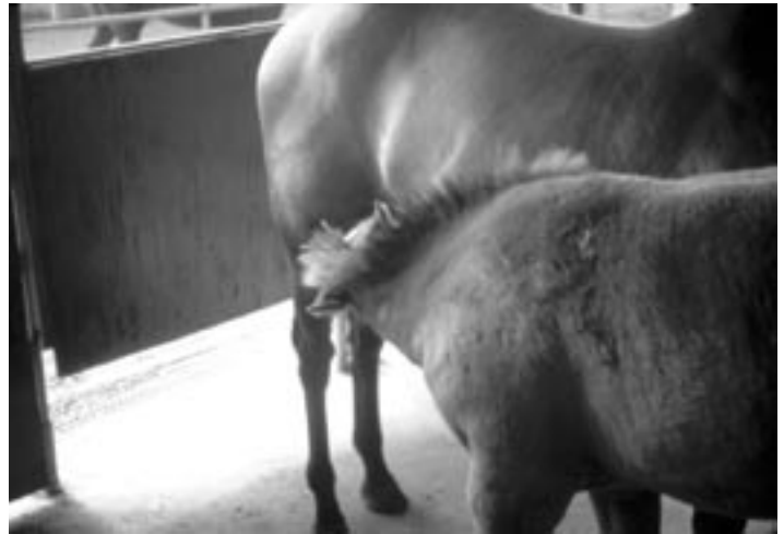
Young foals nurse up to 70 times daily, indicating that they are well suited to small meals.

Before purchasing alfalfa hay, horse owners should ask hay producers whether steps were taken to avoid blister beetles. Blister beetles can be found in other hays, but they are found more often in alfalfa than in other roughage sources.