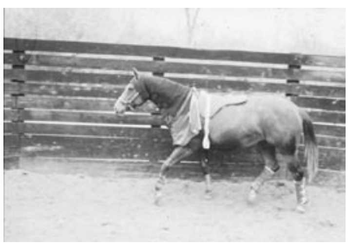
Forced exercise should be conducted on footing that is not too deep.

Routine after-weaning management usually creates an artificial environment of meal feedings. Foals are accustomed to nursing 70 times per day early in life, then typically end up in confinement or semi-confinement, in a meal-feeding situation. While young horses most commonly are fed twice daily, evidence suggests that feeding three or four times in 24 hours actually may improve nutrient absorption while decreasing surges in glucose and insulin.<sup>11</sup> For maximum success and minimal digestive problems, feedings should be evenly spaced, with equal time intervals between each feeding, including from the last feeding of the day to the first feeding of the next day.