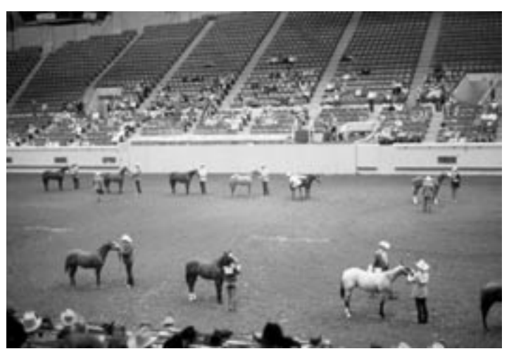
Some young horses must achieve rapid early growth to be competitive.

Sound feeding management, including feeding a balanced nutrient supply, is crucial to improving profit through more marketable and useful horses. With such an approach, problems may still emerge from time to time, but sound early management can be expected to make a difference in young horses' development, regardless of the animals' intended purpose.