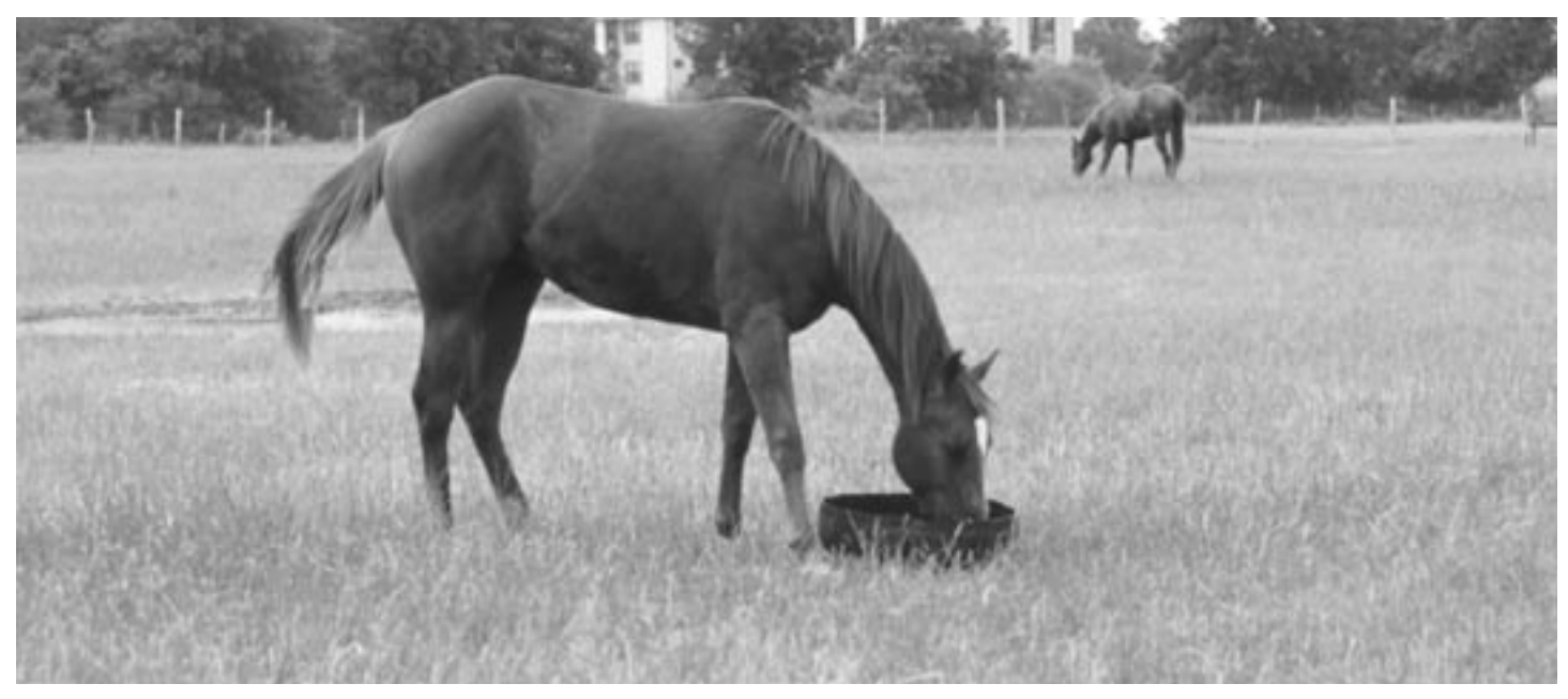
Yearlings will grow at a moderate rate on improved pastures. Supplemental feeding will further improve body condition and gain.

forced exercise should include routine evaluation; in most cases, young horses also will benefit from free exercise. Intense, hard work should be introduced gradually to encourage proper bone remodeling. Sudden changes in stress cause the skeletal system to remodel bone, but it takes time to develop needed strength. If at all possible, conditioning programs should provide adequate free exercise. Some conditioning programs alternate intense work with free exercise and less-intense work on a weekly basis to provide time for bone remodeling to occur. Well over half of Texas farms surveyed reported using forced exercise on an every-other-day basis<sup>12.</sup> Such schedules are supported by research showing the importance of providing adequate recovery time from skeletal strain.<sup>30</sup>