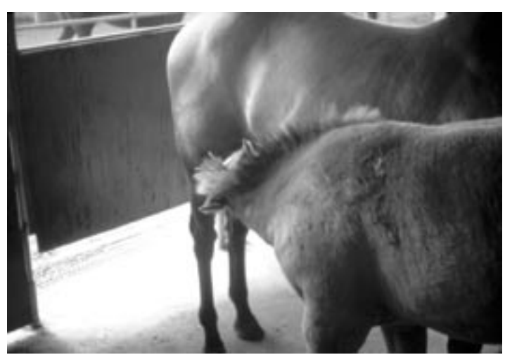
Young foals nurse up to 70 times daily, indicating that they are well suited to small meals.

Before purchasing alfalfa hay, horse owners should ask hay producers whether steps were taken to avoid blister beetles. Blister beetles can be found in other hays, but they are found more often in alfalfa than in other roughage sources.